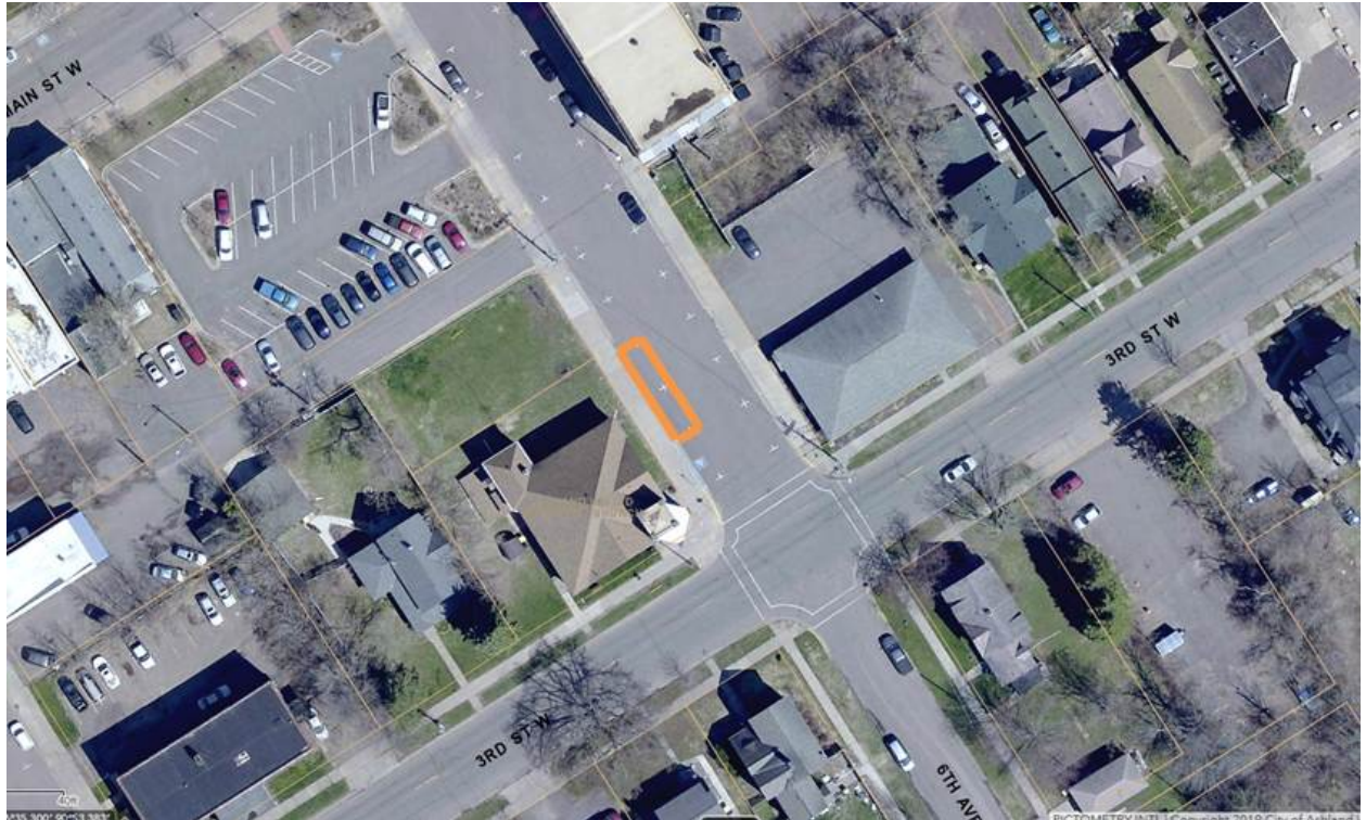
Area map with orange highlight of requested handicap parking spots